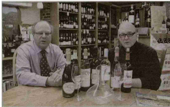
The wine novice and the wine wizard talk summer wines.