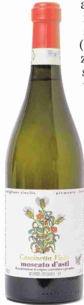
Vietti's Moscato d'Asti

other hand, has a seductive, floral perfume and pretty fruit (orange, orange zest and ripe stone fruit are typical) to go along with that sweetness and slight effervescence. The wine is from a defined area of the Piedmont region of northwestern Italy and is made from moscato bianco (white muscat), considered to be the most complex variety of moscato. (A lot of cheap California moscato is made from the less-desirable muscat of Alexandria.)