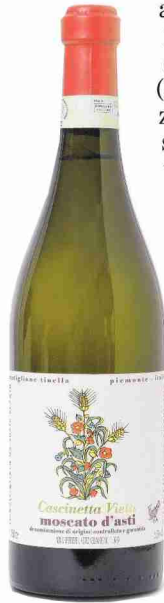
Vietti's Moscato d'Asti

a seductive, floral perfume and pretty fruit (orange, orange zest and ripe stone fruit are typical) to go along with that sweetness and slight effervescence. The wine is from a defined area of the Piedmont region of northwestern Italy and is made from moscato bianco (white muscat), considered to be the most complex variety of moscato. (A lot of cheap California moscato is made from the less-desirable muscat of Alexandria.)