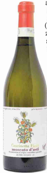
Vietti's Moscato d'Asti

a seductive, floral perfume and pretty fruit (orange, orange zest and ripe stone fruit are typical) to go along with that sweetness and slight effervescence. The wine is from a defined area of the Piedmont region of northwestern Italy and is made from moscato bianco (white muscat), considered to be the most complex variety of moscato. (A lot of cheap California moscato is made from the less-desirable muscat of Alexandria.)