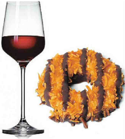
The Vivino app has put together a guide to pairing wine with Girl Scout cookies, including the Caramel deLite.