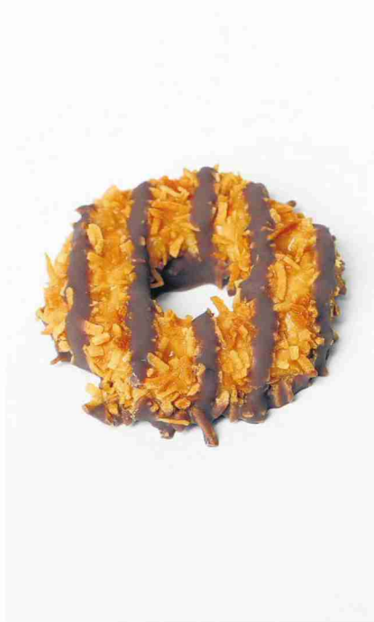
BRYAN CHAN AND ANNE CUSACK Los Angeles Times

The Vivino app has put together a guide to pairing wine with Girl Scout cookies, including Caramel deLite aka Samoas.