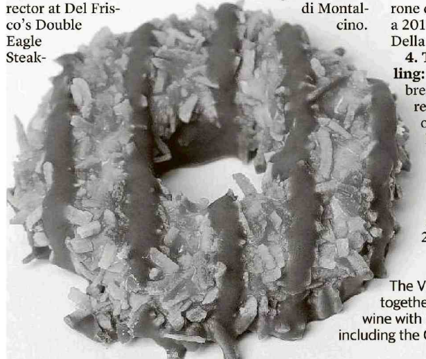
The Vivino app has put together a guide to pairing wine with Girl Scout cookies, including the Caramel deLite.

9. Savannah Smiles and Sancerre: A Sancerre can cut the sweetness of these lemon-flavored cookies but also bring out their citrus flavors. Bottles suggestions include a 2012 Henri Bourgeois Sancerre