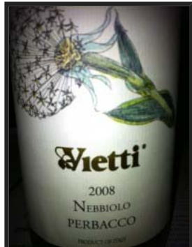
Vietti Perbacco Nebbiolo 2008

The company says these qualify for Barolo as the vineyard sources include Bricco Boschis, Ginestra, Mosconi, Liste, Brunella, Crocetta, Permanno di Fossati and Ravera di Novello e Scarrione. Obviously the better selections and vineyards become the Barolo.