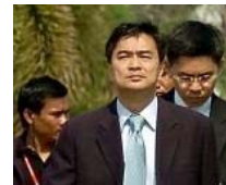
NIDA Poll shows support for Thailand's Democrats drops