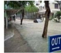
Flash floods in Singapore: PUB's actions too little too late?