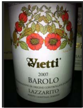
Vietti Single Vineyard 2007-Lazzarito