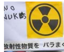
Japan: Nuclear crisis worse than we thought