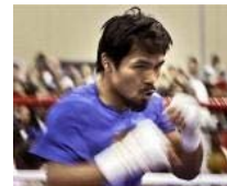
Pacquiao Watch: The offer that never was