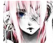
Manga fans get something new to collect: a doctorate