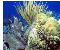
Philippine reef incident: A ticking timebomb